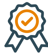
Advanced Quality Management